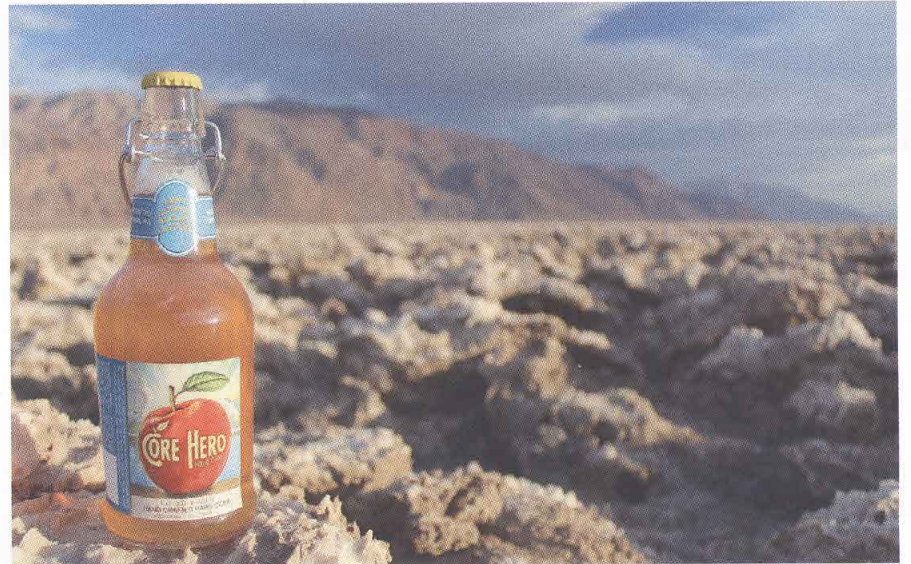
Extra dry Core Hero hard cider

For more information about Core Hero and where to buy, including online sales, visit CoreHeroHardCider.com . The closest store to Woodway is the QFC at 22828 100th Ave. W., Edmonds.