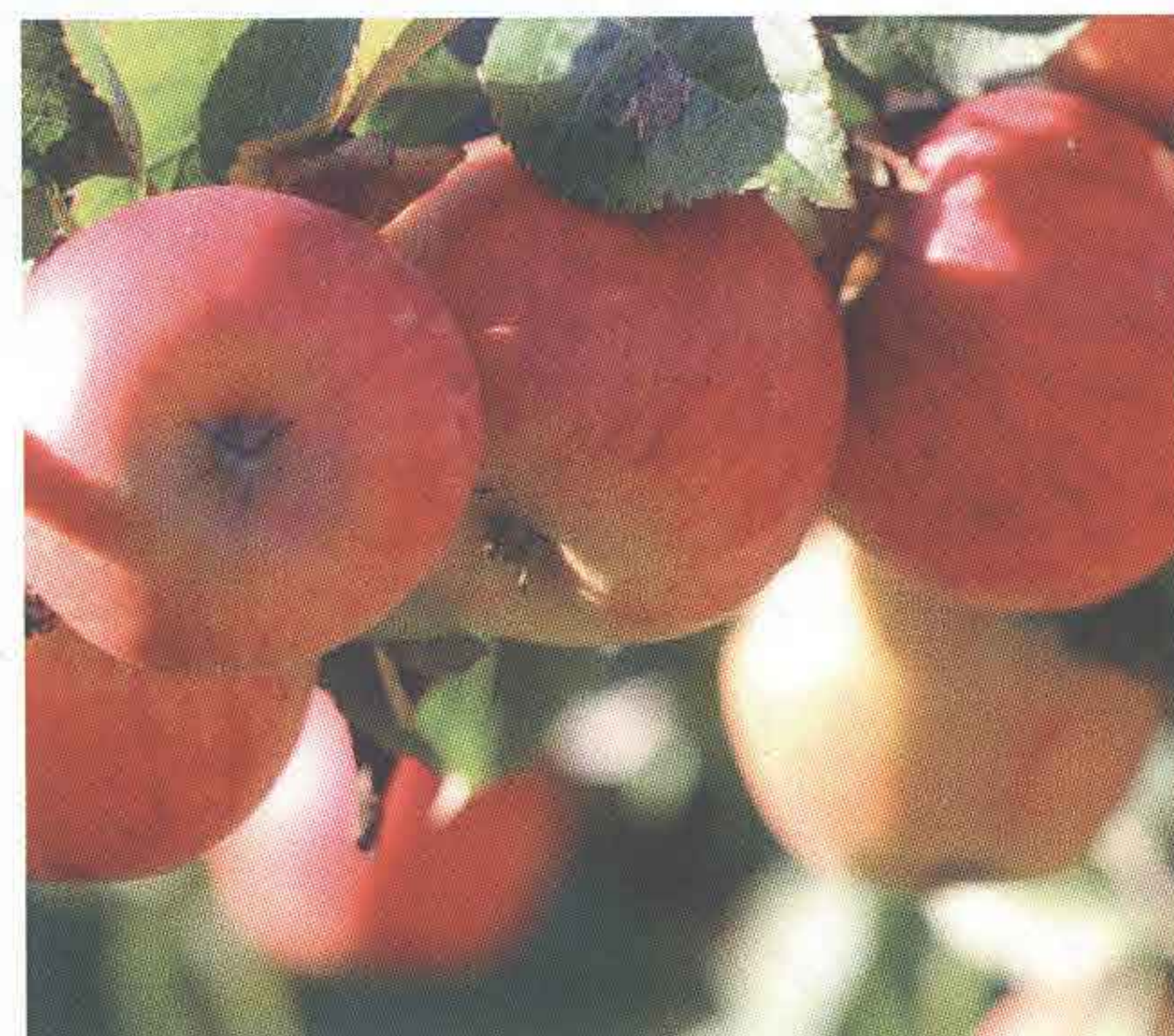
English apple varieties developed in the 1700s give Core Hero's extra dry cider a unique taste.